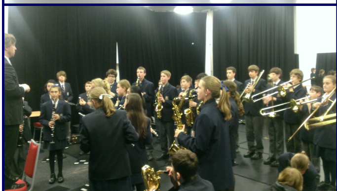
Concert Band 2 warms up behind the scenes

Pennant Hills High School's concert bands have always done well in music eisteddfods, and this year's Yamaha Band Festival was no exception.